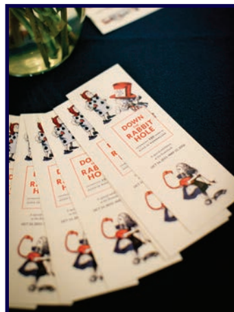
DOWN THE RABBITHOLE OPENING RECEPTION.