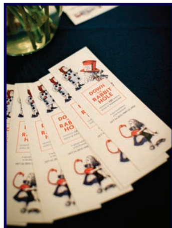
DOWN THE RABBITHOLE OPENING RECEPTION.