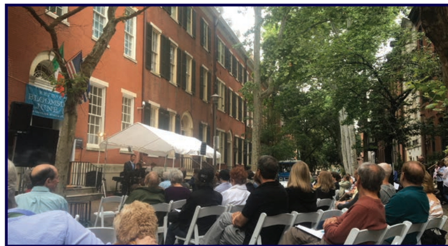
AN OVERCAST BUT WELL-ATTENDED BLOOMSDAY ON DELANCEY PLACE.