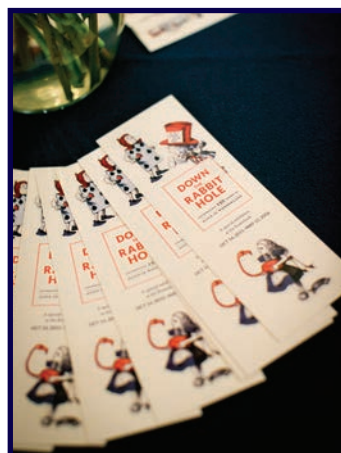
DOWN THE RABBITHOLE OPENING RECEPTION.