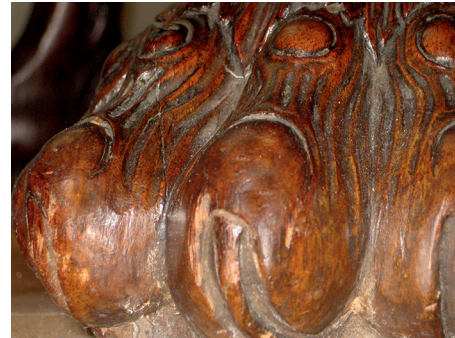
6. Dining Room