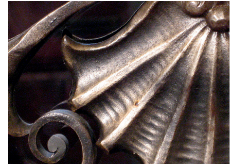
3. First floor hallway