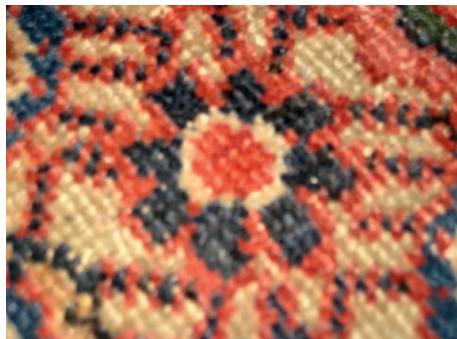
9. East Library