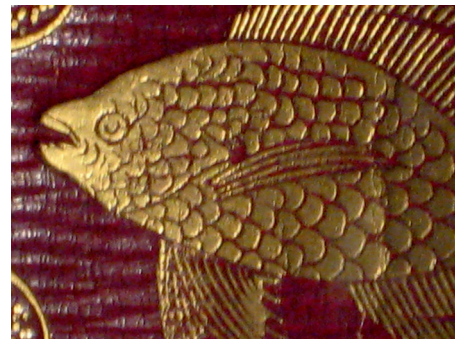
10. Between East & West Libraries