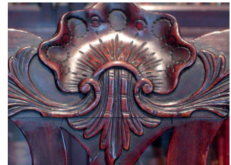
11. West Library