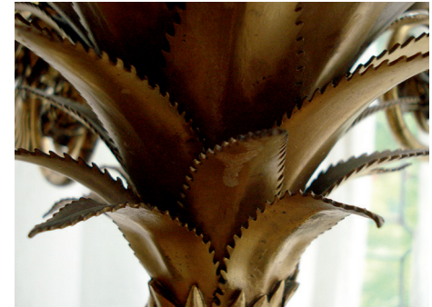
7. Dining Room