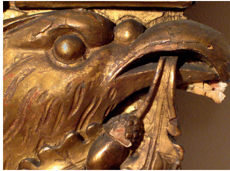
1. First floor hallway

And remember: Look with your eyes not with your hands!