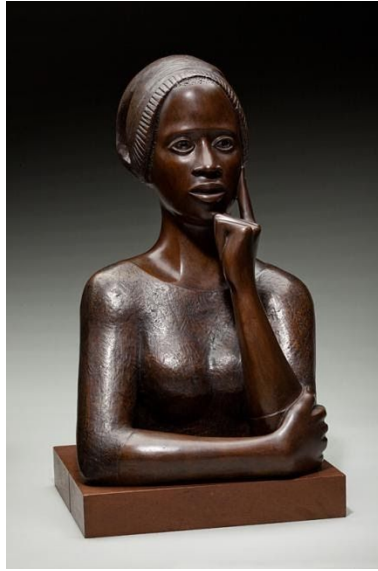
by Elizabeth Catlett