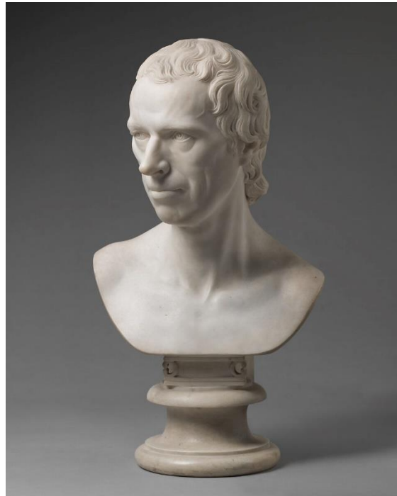
Laurence Sterne by Joseph Nollekens

Laurence Sterne's The Life and Opinions of Tristram Shandy, Gentleman (1759-1767), one of the great novels of the Eighteenth Century, is a nine-volume pseudo-memoir, and simultaneously, a domestic drama and a wild narrative and linguistic adventure, resolutely of its time yet completely timeless. By turns sentimental and bawdy, the book was a publishing sensation: a scandalous, digressive, and transgressive book written by a canny self-publicist with a brilliant turn of phrase, a satirist, a master of innuendo, and, perhaps most surprisingly, a vicar. Shandy , more than any other book, makes you aware of the page itself, the act of printing, with its black pages, its marbled pages, its squiggles and its elaborate punctuation.