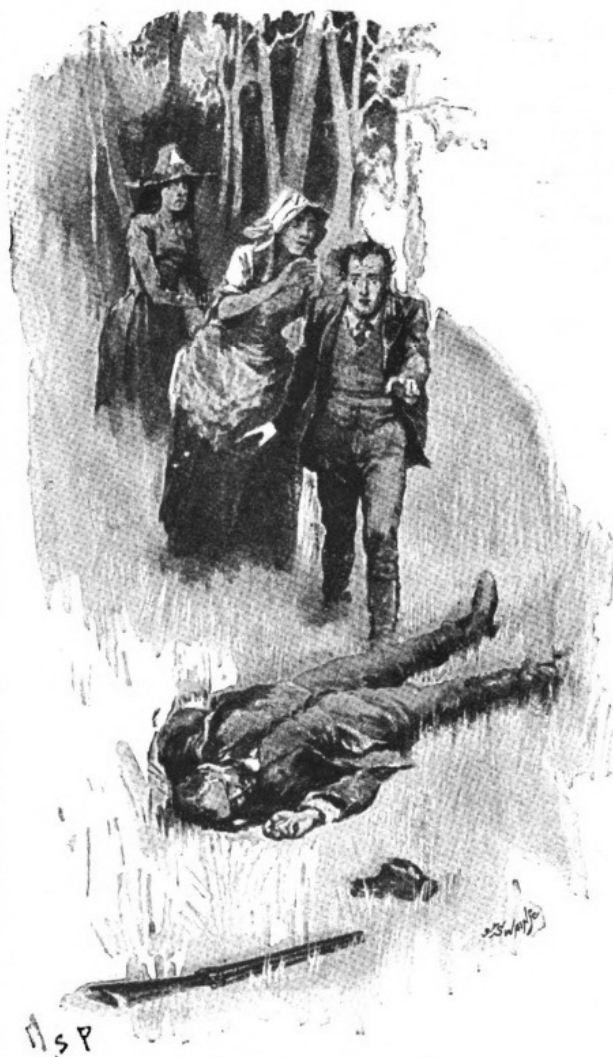
"THEY FOUND THE BODY."

"There is nothing more deceptive than an obvious fact," he answered, laughing.