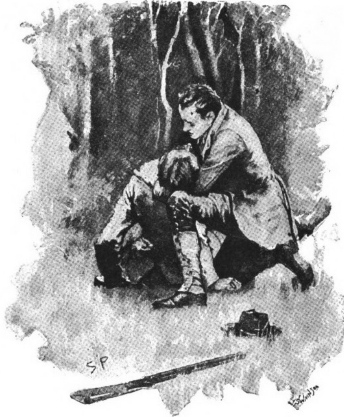
"I HELD HIM IN MY ARMS."

"Witness : He mumbled a few words, but I could only catch some allusion to a rat.