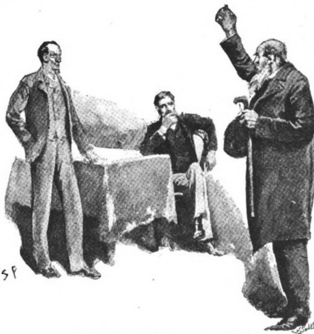
"FAREWELL, THEN," SAID THE OLD MAN.

"Farewell! then," said the old man, solemnly. "Your own death-beds, when they come, will be the easier for the thought of the peace which