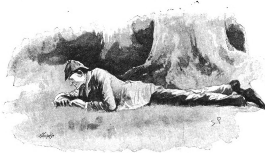
"FOR A LONG TIME HE REMAINED THERE."

and this also he carefully examined and retained. Then he followed a pathway through the wood until he came to the high road, where all traces were lost.