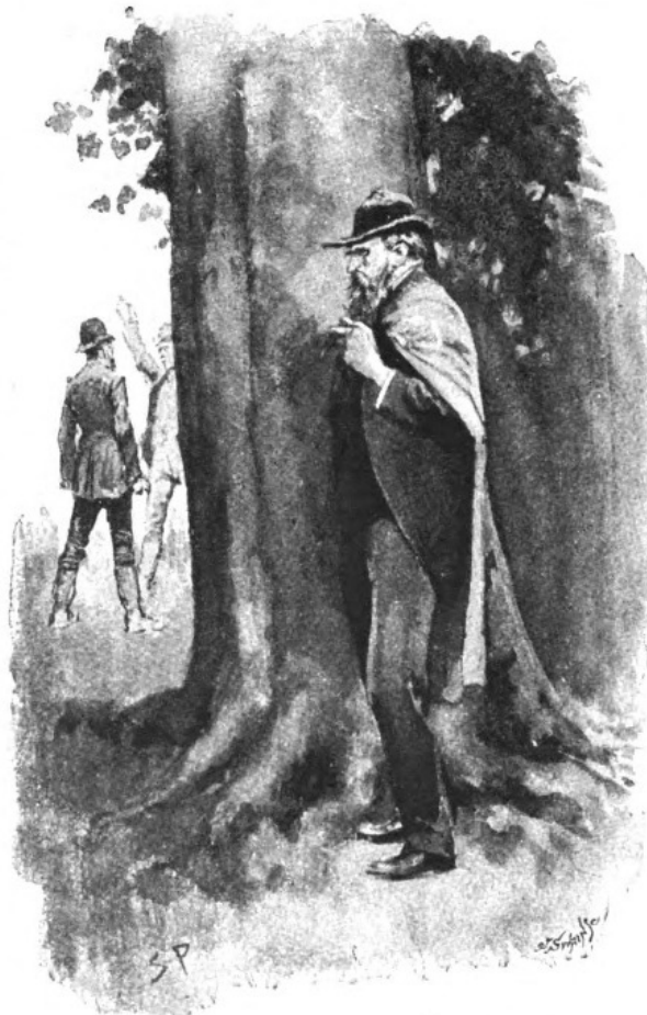
"HE HAD STOOD BEHIND THAT TREE."

Sherlock Holmes took a folded paper from his pocket and flattened it out on the table. "This is a map of the Colony of Victoria," he said. "I wired to Bristol for it last night." He put