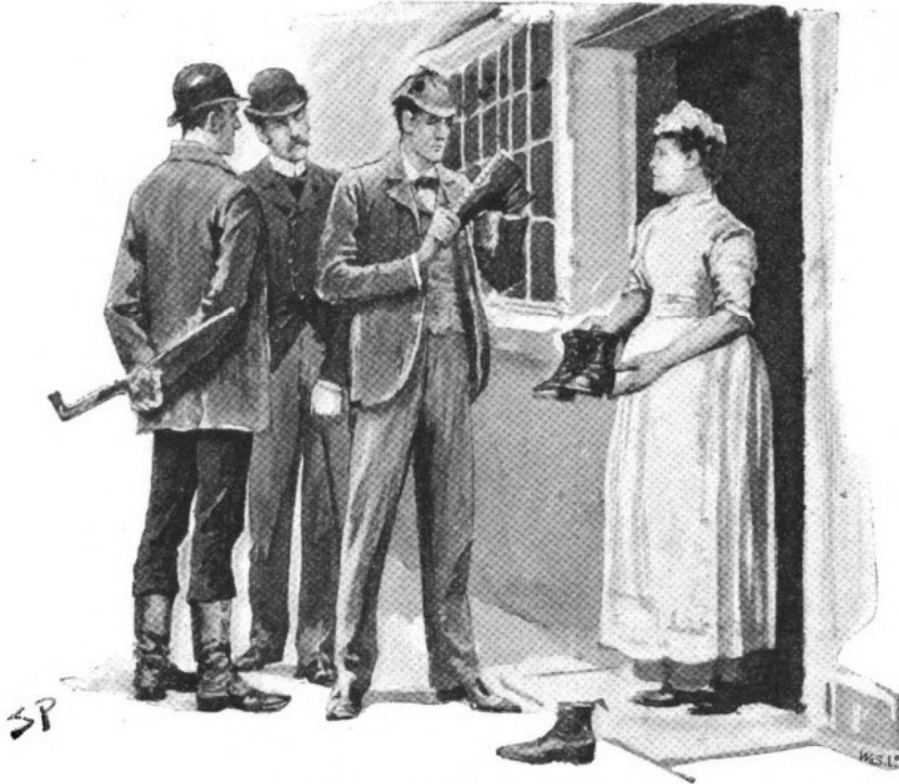
"THE MAID SHOWED US THE BOOTS."

ing measured these very carefully from seven or eight different points, Holmes desired to be led to the courtyard, from which we all followed the winding track which led to Boscombe Pool.