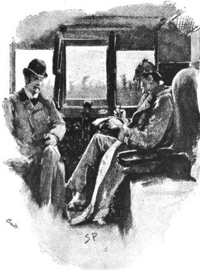
"WE HAD THE CARRIAGE TO OURSELVES."

"The London press has not had very full accounts. I have just been looking through all the recent papers in order to master the particulars. It seems, from what I gather, to be one of those simple cases which are so extremely difficult."