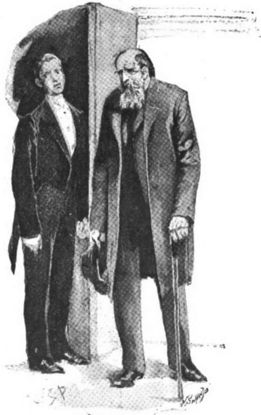
"MR. JOHN TURNER," SAID THE WAITER.

The man who entered was a strange and impressive figure. His slow, limping step and bowed shoulders gave the appearance of decrepitude, and yet his hard, deep-lined, craggy features, and his enormous limbs showed that he was possessed of unusual