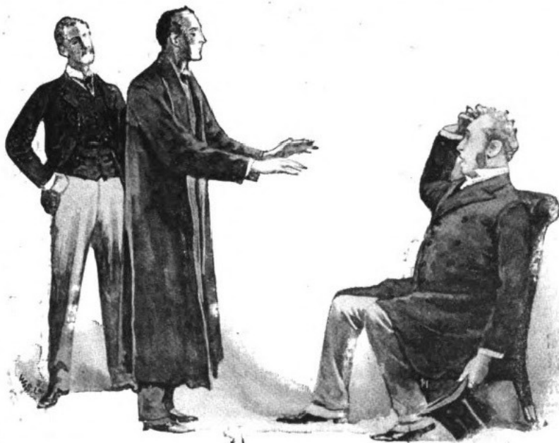
"WITH A LOOK OF GRIEF AND DESPAIR."

A few moments later he was in our room, still puffing, still gesticulating, but with so fixed a look of grief and despair in his eyes that our smiles were turned in an instant to horror and pity. For a while he could not get his words out, but swayed his body and plucked at his hair like one who has been driven to the extreme limits of his reason. Then, suddenly springing