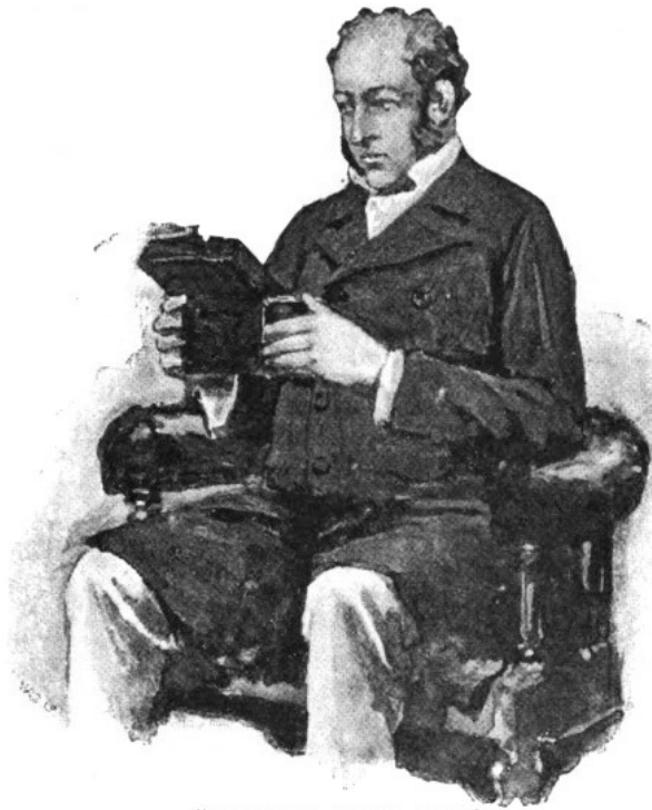
"I TOOK THE PRECIOUS CASE."

"Precisely.' He opened the case, and there, embedded in soft, flesh-coloured velvet, lay the magnificent piece of jewellery which he had named. 'There are thirty-