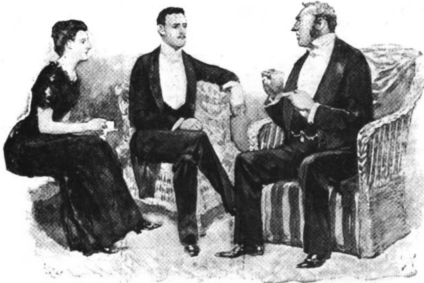
"OH, ANY OLD KEY WILL FIT THAT BUREAU."

followed me to my room, however, that night with a very grave face.