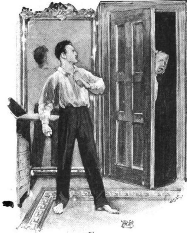
“AT MY CRY HE DROPPED IT.”

"Arthur!" I screamed, 'you villain! you thief! How dare you touch that coronet?'