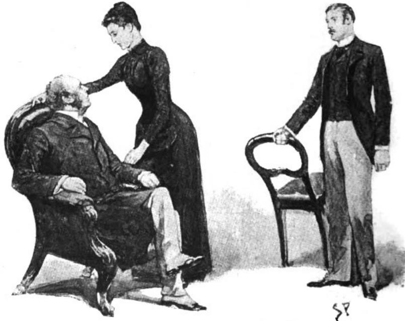
"SHE WENT STRAIGHT TO HER UNCLE."

"You have given orders that Arthur should be liberated, have you not, dad?" she asked.