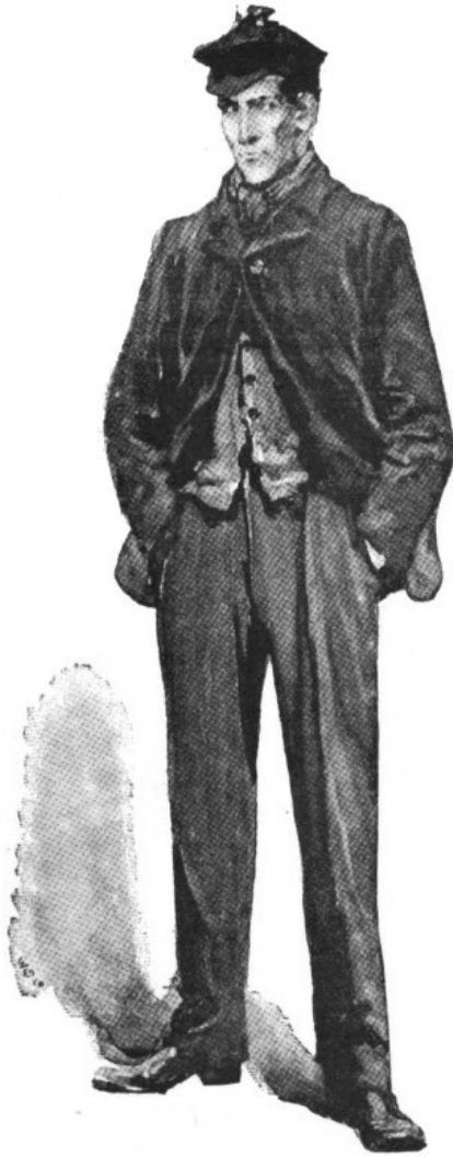
"DRESSED AS A COMMON LOAFER."

selves in our room once more. He hurried to his chamber and was down again in a few minutes dressed as a common loafer. With his collar turned up, his shiny seedy coat, his red cravat, and his worn boots, he was a perfect sample of the class.