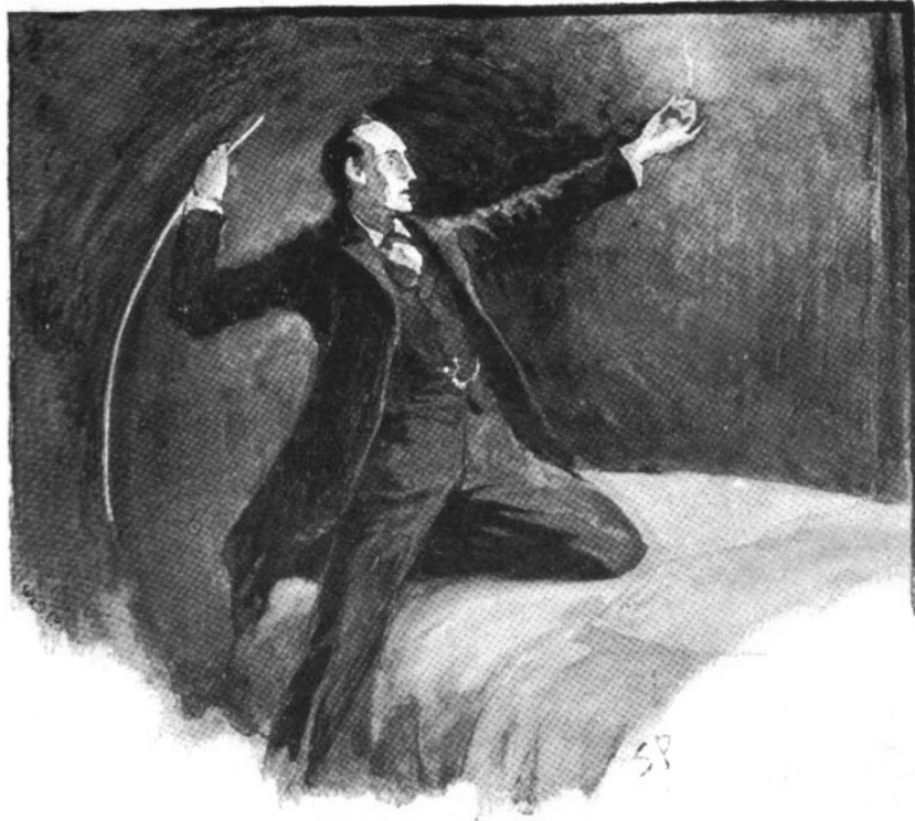
"HOLMES LASHED FURIOUSLY."

smell grew stronger. For half an hour I sat with straining ears. Then suddenly another sound became audible—a very gentle, soothing sound, like that of a small jet of steam escaping continually from a kettle. The instant that we heard it, Holmes sprang from the bed, struck a match, and lashed furiously with his cane at the bell-pull.