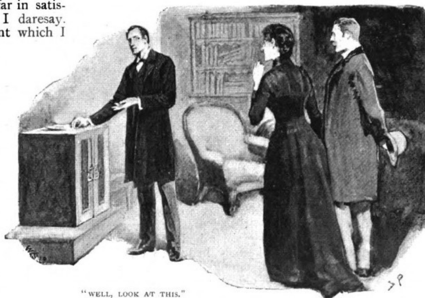
"WELL, LOOK AT THIS."

"Very good. Your windows would be visible from there?"