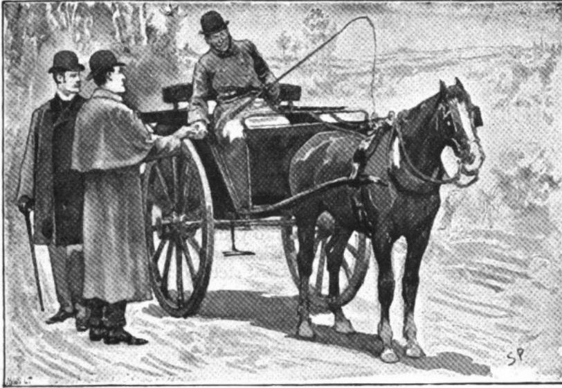
"WE GOT OFF, PAID OUR FARE."

"I thought it as well," said Holmes, as we climbed the stile, "that this fellow should think we had come here as architects, or on some definite business. It may stop his gossip. Good afternoon, Miss Stoner. You see that we have been as good as our word."