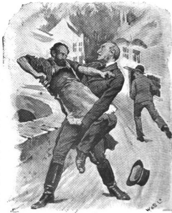
"HE HURLED THE BLACKSMITH OVER A PARAPET."

"Last week he hurled the local blacksmith over a parapet into a stream, and it was only by paying over all the money which I could gather together that I was able to avert another public exposure. He had no friends at all save the wandering gipsies, and he would give these vagabonds leave to encamp upon the few acres of