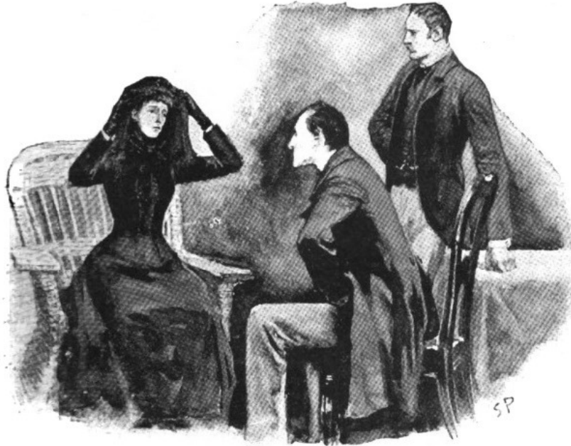
"SHE RAISED HER VEIL."

but her hair was shot with premature grey, and her expression was weary and haggard. Sherlock Holmes ran her over with one of his quick, all-comprehensive glances.