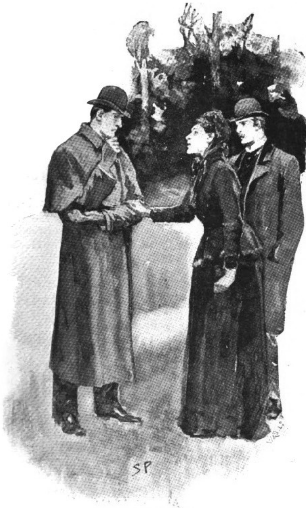
"GOOD-BYE, AND BE BRAVE."

saw us, our journey would be in vain. Good-bye, and be brave, for if you will do what I have told you, you may rest assured that we shall soon drive away the dangers that threaten you."