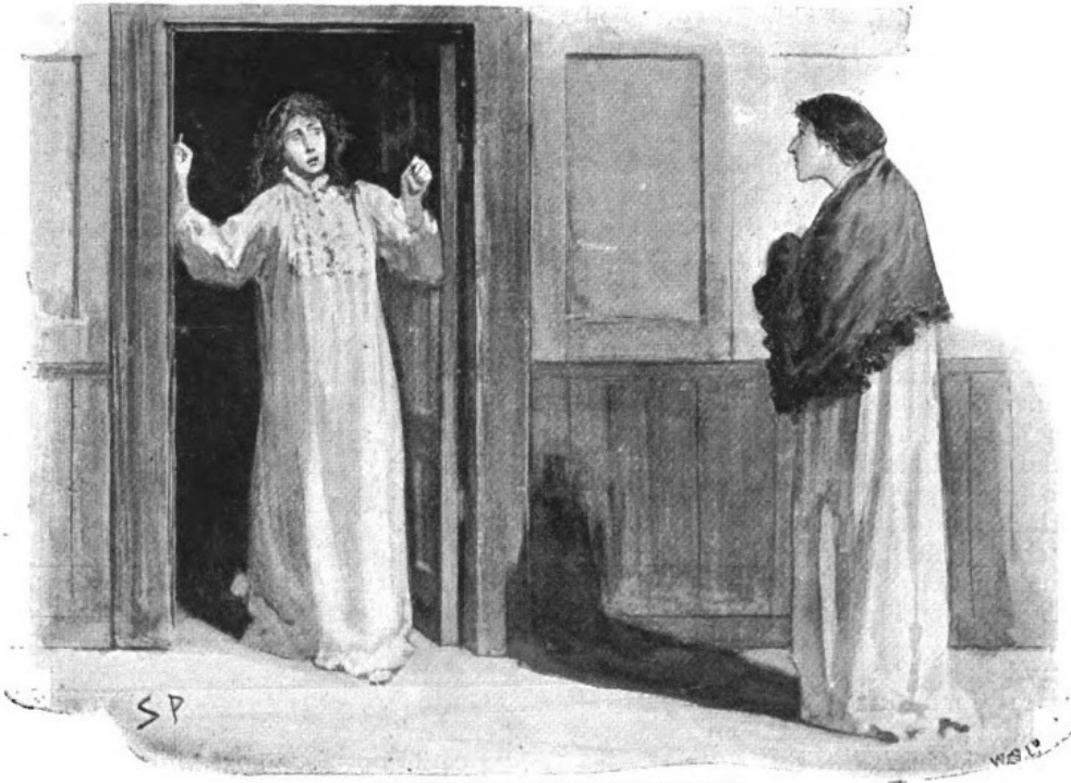
"HER FACE BLANCHED WITH TERROR."

"No, she was in her nightdress. In her right hand was found the charred stump of a match, and in her left a matchbox."