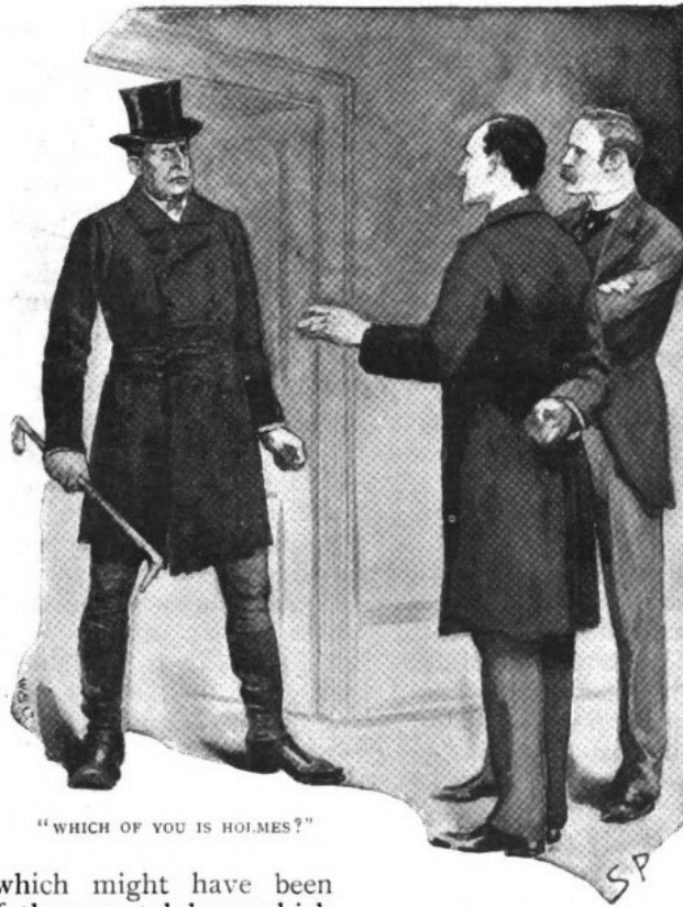
"WHICH OF YOU IS HOLMES?"

"But I have heard that the crocuses promise well," continued my companion imperturbably.