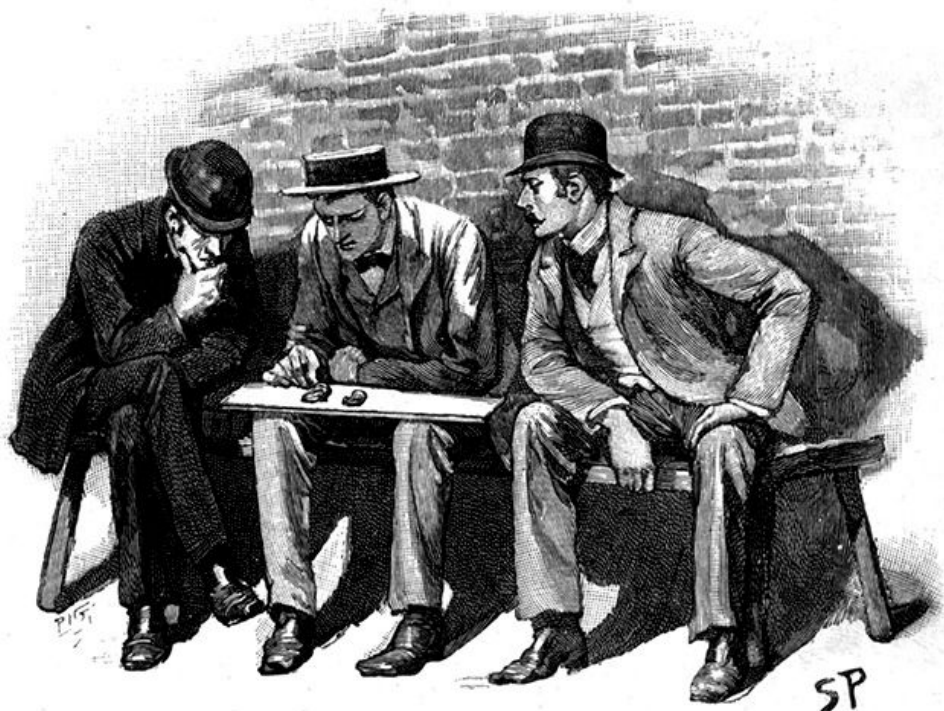
"HE EXAMINED THEM MINUTELY."

He took out the two ears as he spoke, and laying a board across his knees, he examined them minutely, while Lestrade and I, bending forward on each side of him, glanced