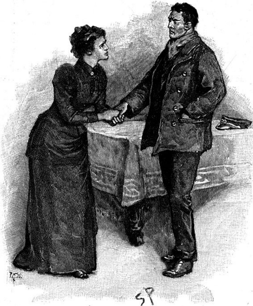
"'THAT'S ALL RIGHT, MY LASS, SAID I.'"

"It was only a little thing, too. I had come into the parlour unexpected, and as I walked in at the door I saw a light of welcome on my wife's face. But as she saw who it was it faded again, and she