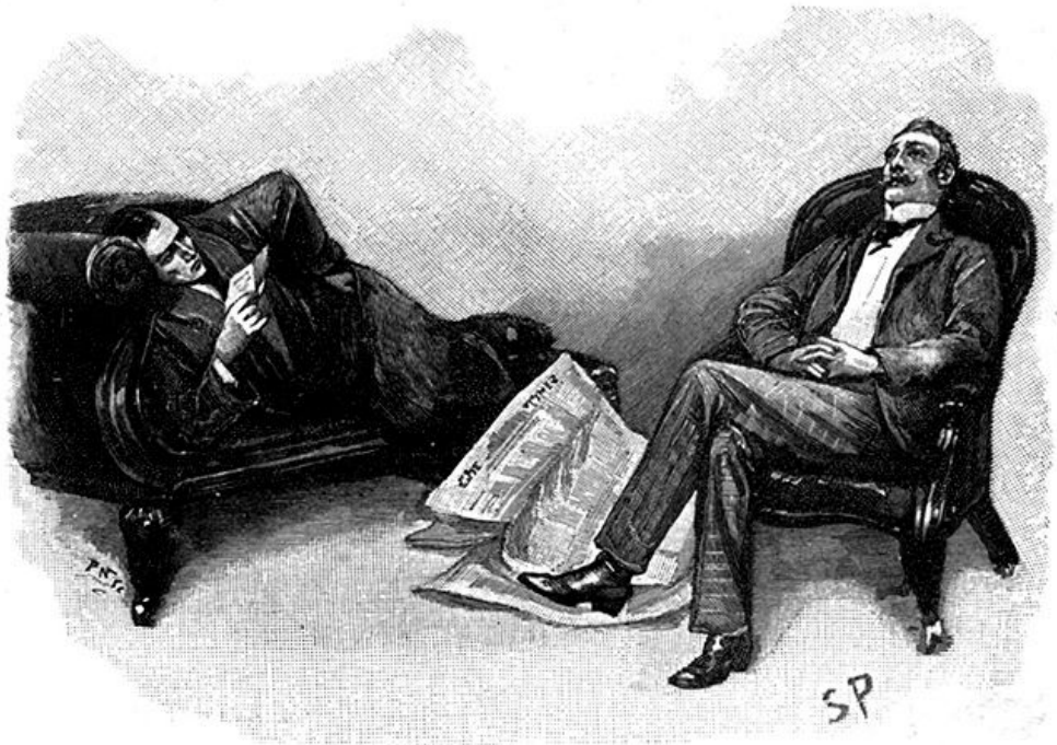
"I FELL INTO A BROWN STUDY."

"You are right, Watson," said he. "It does seem a most preposterous way of settling a dispute."