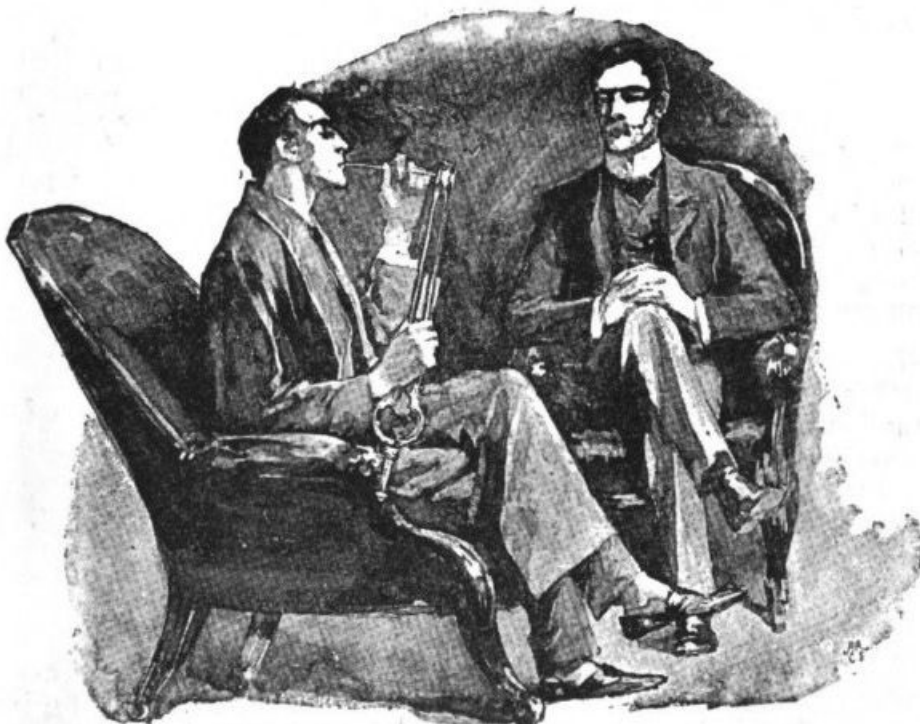
“TAKING UP A GLOWING CINDER WITH THE TONGS.”

It was a cold morning of the early spring, and we sat after breakfast on either side of a cheery fire in the old room at Baker-street. A thick fog rolled down between the lines of dun-coloured houses, and the opposing windows loomed like dark, shapeless blurs through the heavy yellow wreaths. Our gas was lit, and shone on the white cloth, and glimmer of china and metal, for the table had not been cleared yet. Sherlock Holmes had been