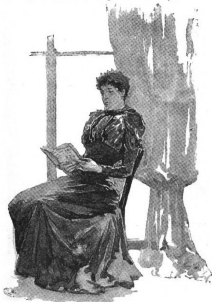
"I READ FOR ABOUT TEN MINUTES."

"Two days later this same performance was gone through under exactly similar circumstances. Again I changed my dress, again I sat in the window, and again I laughed very heartily at the funny stories of which my employer had an immense répertoire , and which he told inimitably. Then he handed me a yellow-backed novel, and, moving my chair a little sideways, that my own shadow might not fall upon