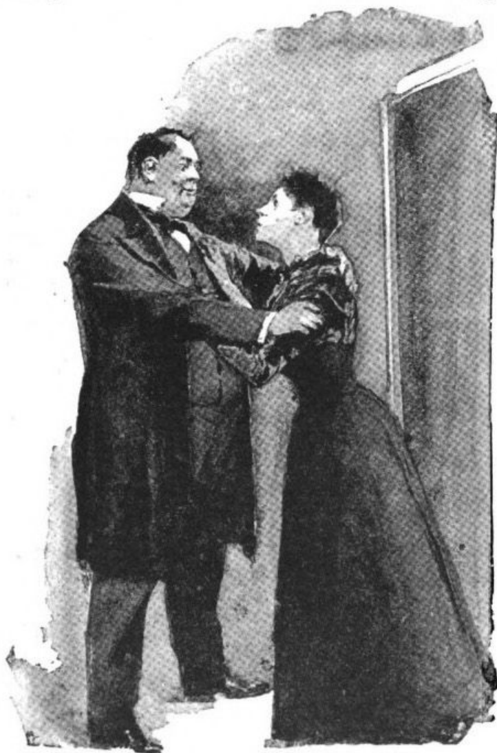
“‘OH! I AM SO FRIGHTENED!’ I PANTED.”

Holmes and I had listened spell-bound to this extraordinary story.