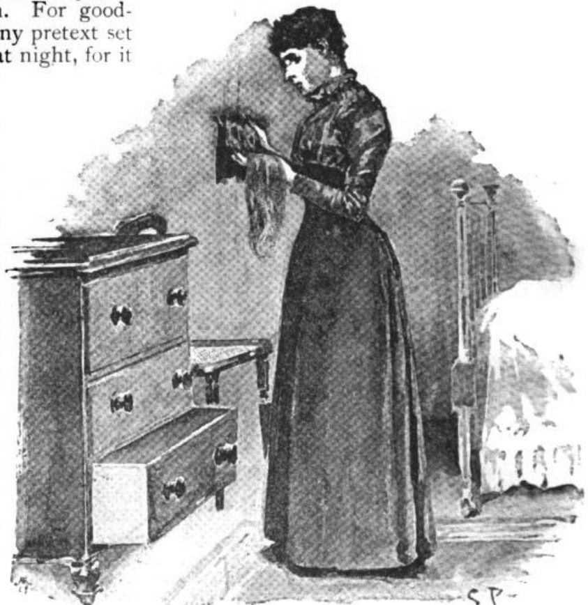
"I TOOK IT UP AND EXAMINED IT."

"I took it up and examined it. It was of the same peculiar tint, and the same thickness. But then the impossibility of the thing obtruded itself upon me. How could my hair have been locked in the drawer?"