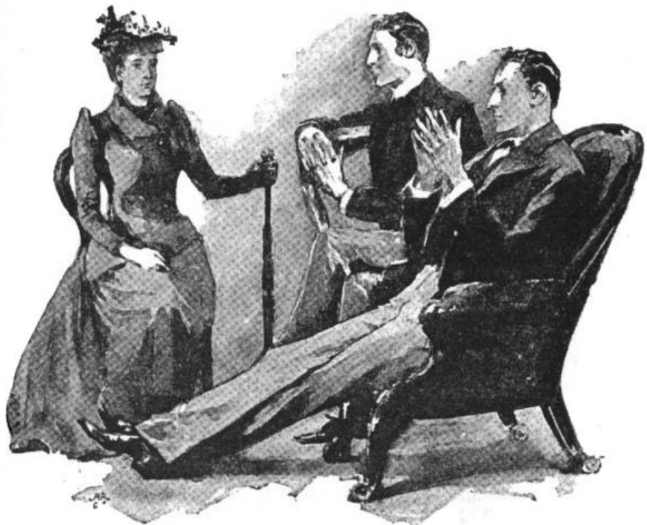
"HOLMES SHOOK HIS HEAD GRAVELY."

Holmes shook his head gravely. "It would cease to be a danger if we could define it," said he. "But at any time, day or night, a telegram would bring me down to your help."