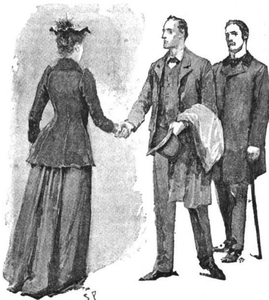
"I AM SO DELIGHTED THAT YOU HAVE COME."

order." Holmes thrust his long thin legs out towards the fire, and composed himself to listen.