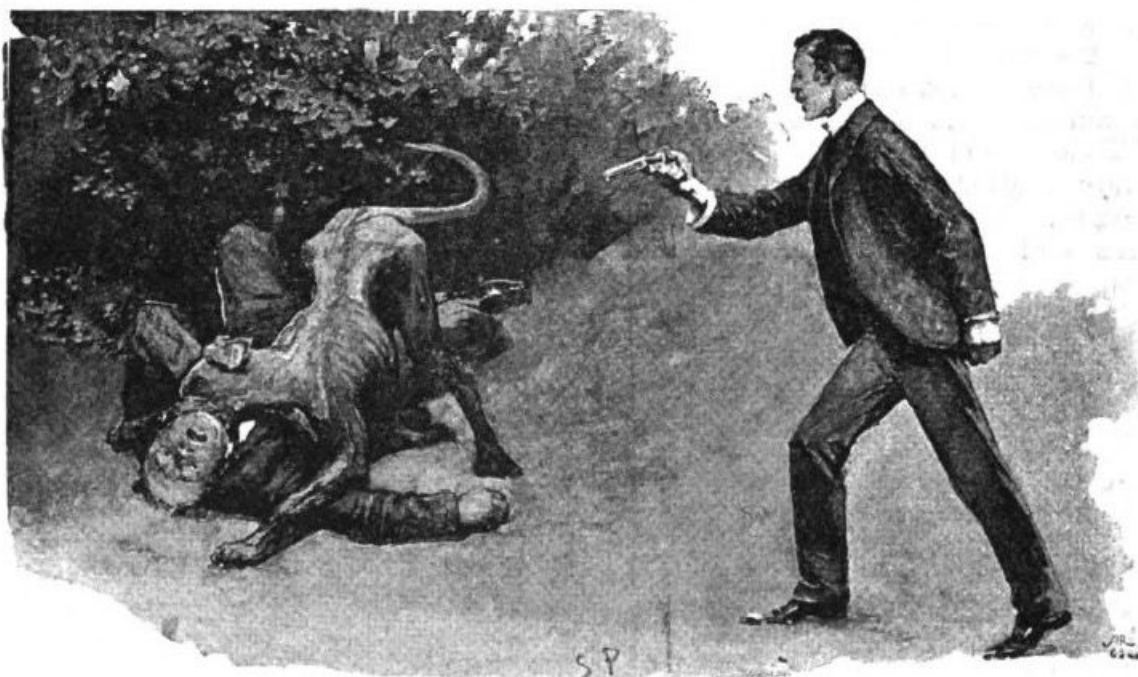
RUNNING UP, I BLEW ITS BRAINS OUT.

"She was never happy at home, Miss Alice wasn't, from the time that her father married again. She was slighted like, and had no say in anything; but it never really became bad for her until after she met Mr. Fowler at a friend's house. As well as I could learn, Miss Alice had rights of her own by will, but she was so quiet and patient, she was, that she never said a word about them, but just left everything in Mr. Rucastle's hands. He knew he was safe