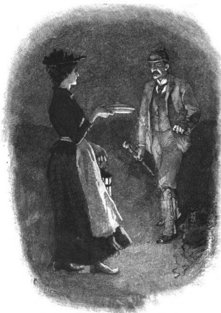
"A MAN APPEARED OUT OF THE DARKNESS."

"What business have you here?' asked the lad.