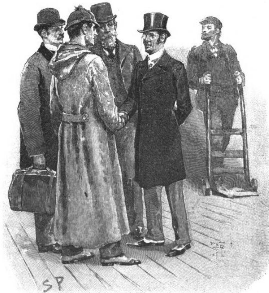
"I AM DELIGHTED THAT YOU HAVE COME DOWN, MR. HOLMES."

"Undoubtedly. He has neither a knife nor any sign of a wound. The evidence against him is certainly very strong. He had a great interest in the