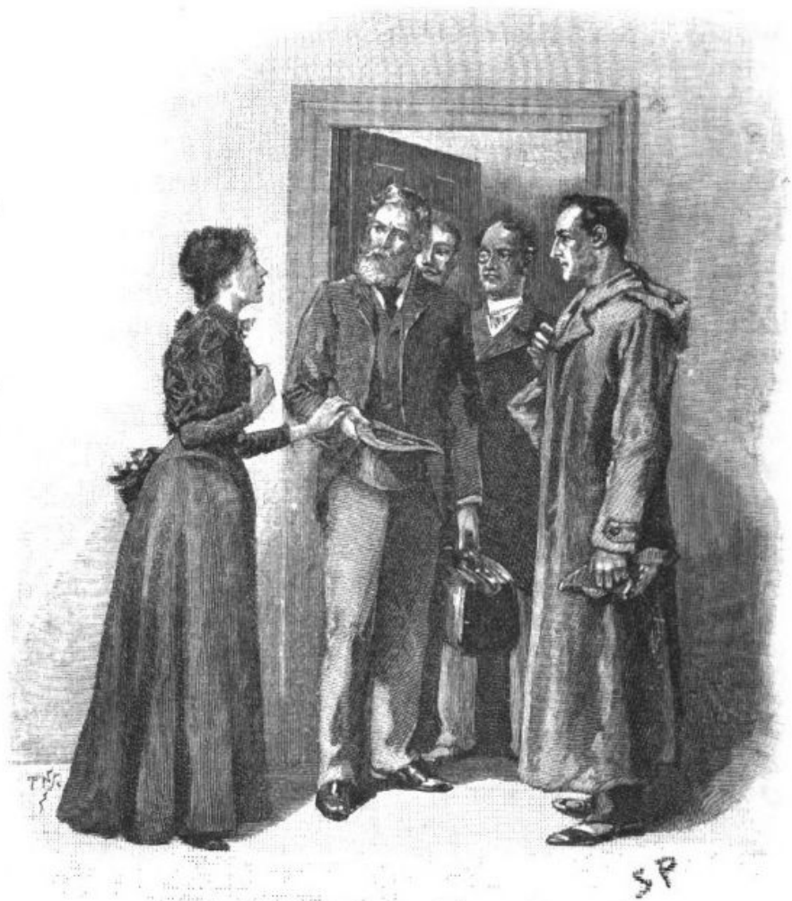
"HAVE YOU FOUND THEM?" SHE PANTED.

"Dear me; why, I could have sworn to it. You wore a costume of dove-coloured silk, with ostrich feather trimming."