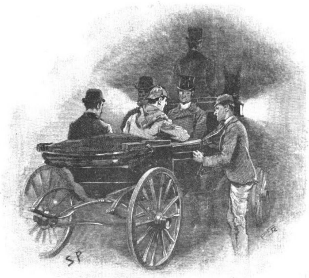
"HOLMES WAS EXTREMELY PLEASED."

"Is there any other point to which you would wish to draw my attention?"