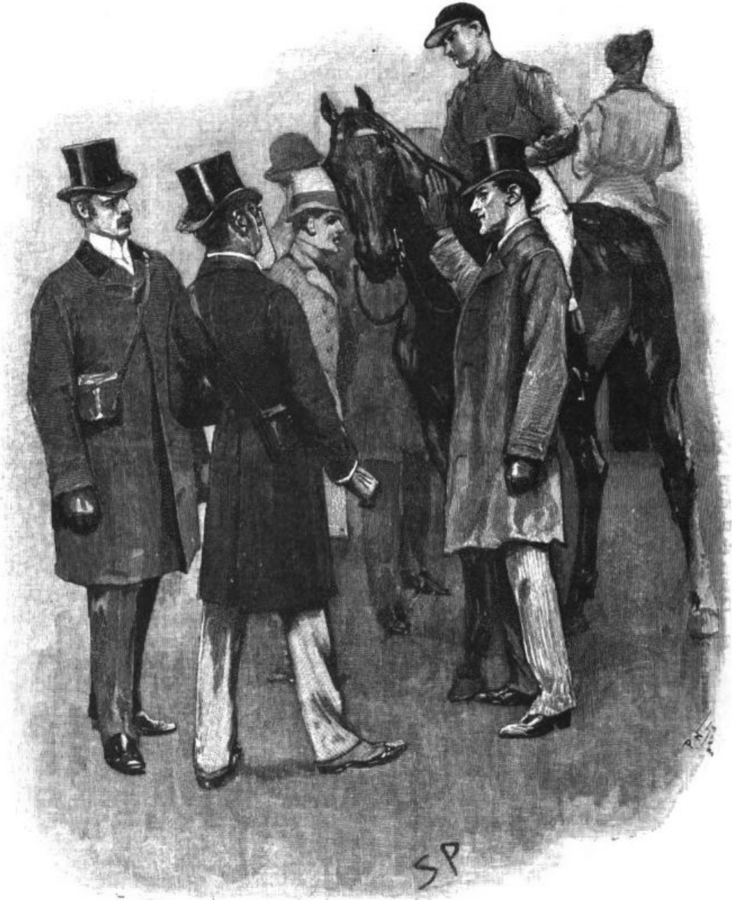
HE LAID HIS HAND UPON THE GLOSSY NECK.

crime, Colonel," said he; "the real murderer is standing immediately behind you!"