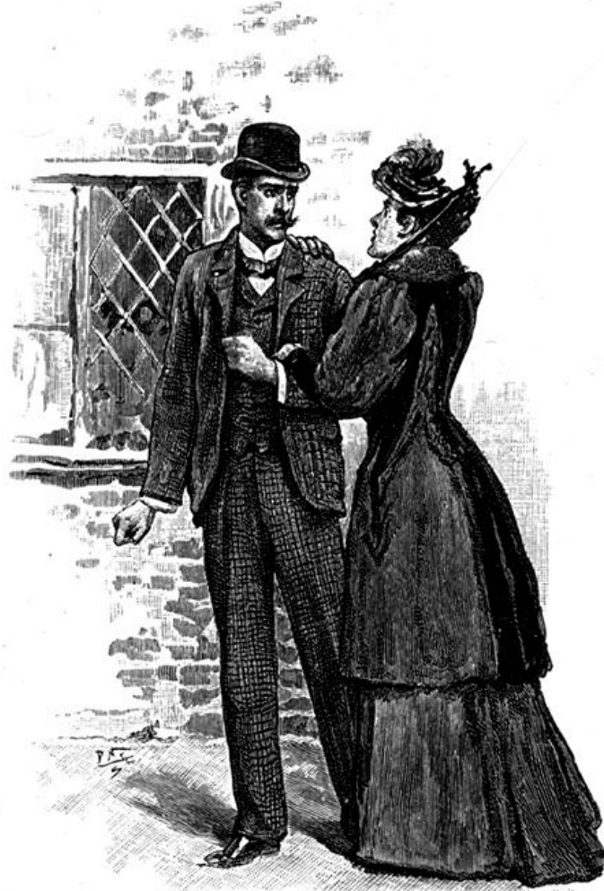
"'TRUST ME, JACK!' SHE CRIED."

"'No, no, Jack, for God's sake!' she gasped, in uncontrollable emotion. Then as I approached the door she seized