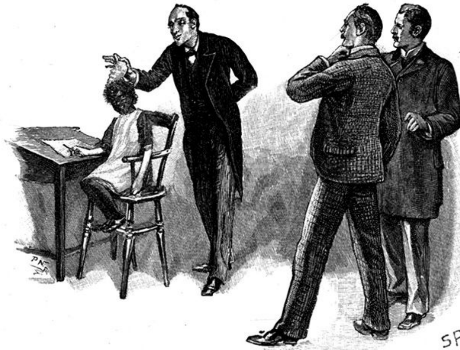
"THERE WAS A LITTLE COAL-BLACK NEGRESS."

"When I left her in America," she continued, "it was only because her health was weak, and the change might have done her harm. She was given to the care of a faithful Scotch-woman who had once been our servant. Never for an instant did I dream of disowning her as my child. But when chance threw you in my way, Jack, and I learned to love you, I feared to tell you about my child. God for-