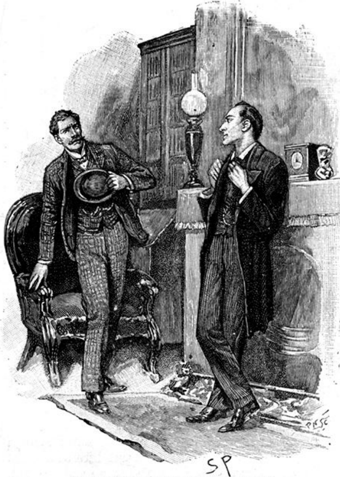
"OUR VISITOR SPRANG FROM HIS CHAIR."

"I'll tell you what I know about Effie's history. She was a widow when I met her first, though quite young—only twenty-five. Her name then was Mrs. Hebron. She went out to America when she was young and lived in the town of Atlanta, where she married this Hebron, who was a lawyer with a good practice. They had one child, but the yellow fever broke out badly in the place, and both husband and child died of it. I have seen his death certificate. This sickened her of America, and she came back to live with a maiden aunt at Pinner, in Middlesex. I may mention that her husband had left her comfortably off, and that she had a capital of