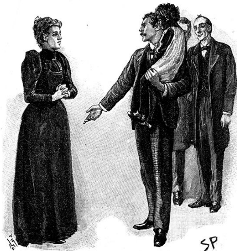
"HE LIFTED THE LITTLE CHILD."

It was a long two minutes before Grant Munro broke the silence, and when his answer came it was one of which I love to think. He lifted the little child, kissed her, and