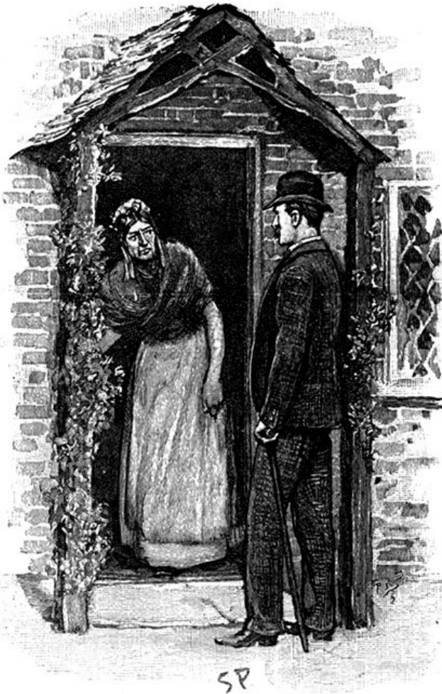
“WHAT MAY YOU BE WANTIN’?”

though I tried to think of other things, my mind would still turn to the apparition at the window and the rudeness of the woman. I determined to say nothing about the former to my wife, for she is a nervous, highly-strung woman, and I had no wish that she should share the unpleasant impression which had been produced upon myself. I remarked to her, however, before I fell asleep that the cottage was now occupied, to which she returned no reply.