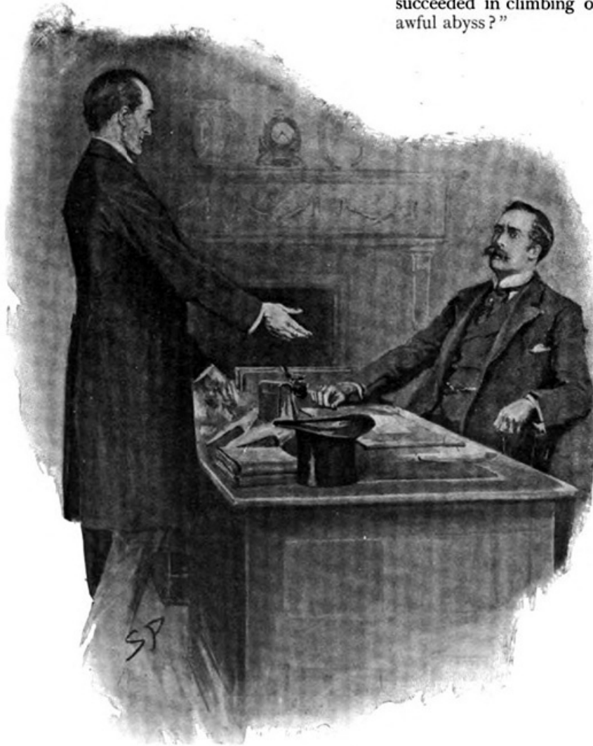
"SHERLOCK HOLMES WAS STANDING SMILING AT ME ACROSS MY STUDY TABLE."

"Holmes!" I cried. "Is it really you? Can it indeed be that you are alive? Is it possible that you succeeded in climbing out of that awful abyss?"