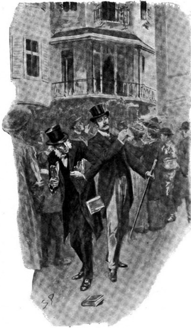
"I KNOCKED DOWN SEVERAL BOOKS WHICH HE WAS CARRYING."

"Well, I've a conscience, sir, and when I chanced to see you go into this house, as I came hobbling after you, I thought to myself, I'll just step in and see that kind gentleman, and tell him that if I was a bit