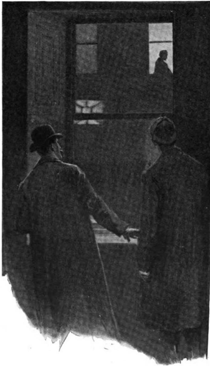
"I CREEPT FORWARD AND LOOKED ACROSS AT THE FAMILIAR WINDOW."