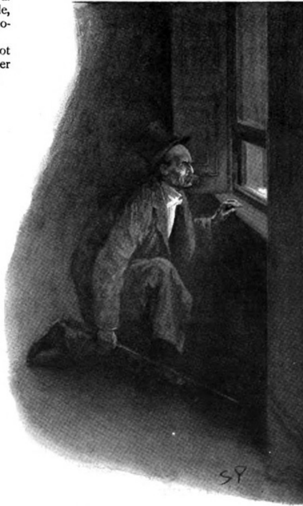
"THE LIGHT OF THE STREET FELL FULL UPON HIS FACE."

But suddenly I was aware of that which his keener senses had already distinguished. A low, stealthy sound came to my ears, not from the direction of Baker Street, but from the back of the very house in which we lay concealed. A door opened and shut. An instant later steps crept down the passage—steps which were meant to be silent, but which reverberated harshly through the empty house. Holmes crouched back against the wall and I did the same, my hand closing upon the handle of my