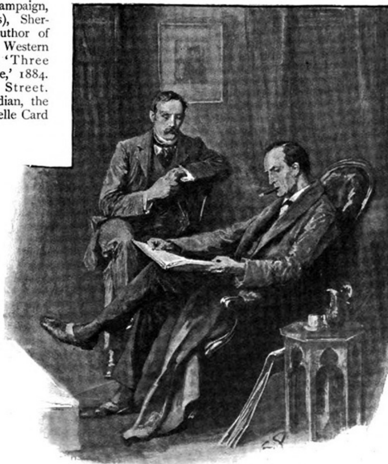
"MY COLLECTION OF M'S IS A FINE ONE," SAID HE."

"Well, I don't insist upon it. Whatever the cause, Colonel Moran began to go wrong. Without any open scandal he still made India too hot to hold him. He retired, came to London, and again acquired an evil name. It was at this time that he was sought out by Professor Moriarty, to whom for a time he was chief of the staff. Moriarty supplied him liberally with money and used him only in one or two very high-