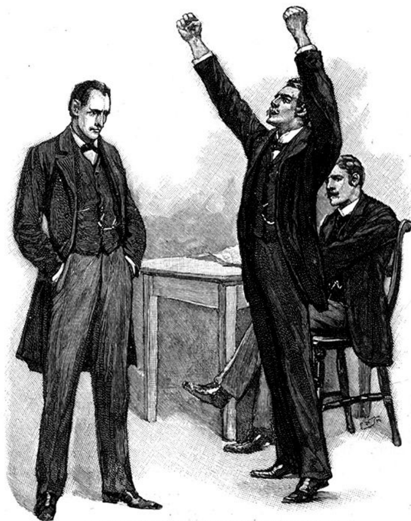
"PYCROFT SHOOK HIS CLENCHED HANDS IN THE AIR."

"Very good, we shall wire to him, and see if all is well, and if a clerk of your name is working there. That is clear enough, but what is not so clear is why at sight of us one of the rogues should instantly walk out of the room and hang himself."