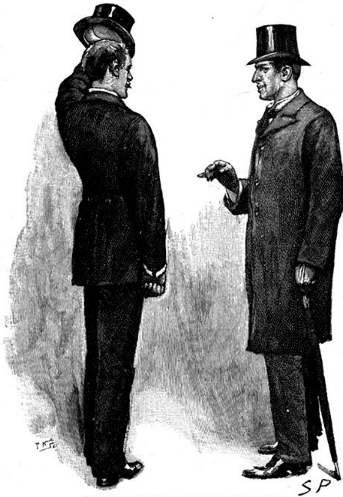
"UP CAME A MAN AND ADDRESSED ME."