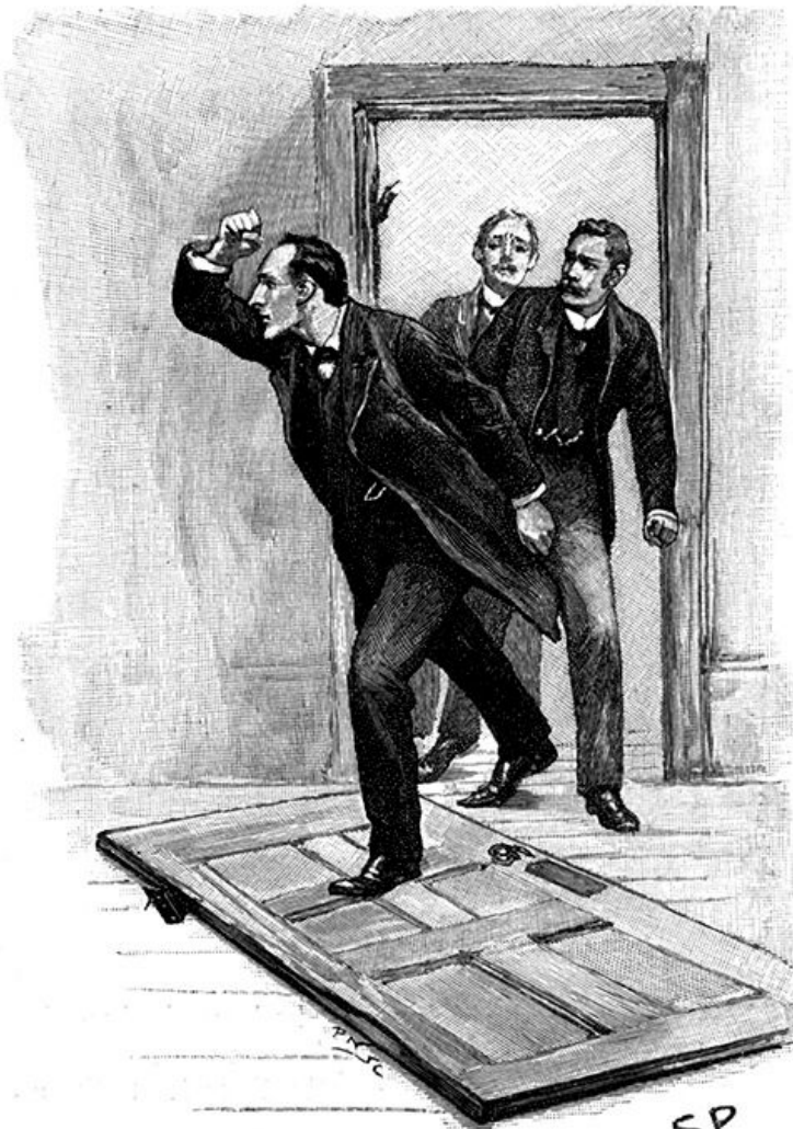
"WE FOUND OURSELVES IN THE INNER ROOM."