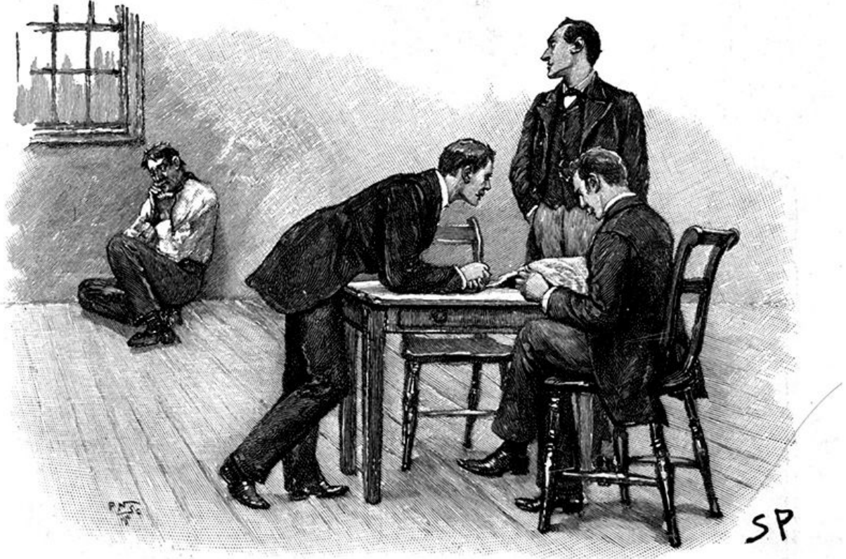
"GLANCING AT THE HAGGARD FIGURE."

"Well, we may save the police some little trouble in that direction," said Holmes, glancing at the haggard figure huddled up by the window. "Human nature is a strange mixture, Watson. You see that even a villain and a murderer can inspire