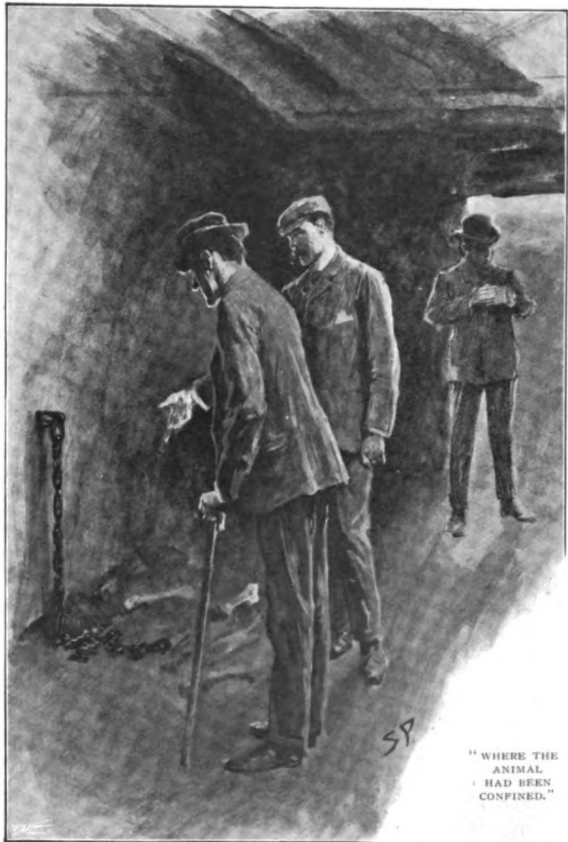
"WHERE THE ANIMAL HAD BEEN CONFINED."

"A dog!" said Holmes. "By Jove, a curly-haired spaniel. Poor Mortimer will never see his pet again. Well, I do not know that this place contains any secret which we have not already fathomed. He could hide his hound, but he could not hush its voice, and hence came those cries which even in daylight were not pleasant to hear. On an emergency he could keep the hound in the outhouse at Merripit, but it was always a risk, and it was only on the supreme day, which he regarded as the end of all his efforts, that he dared to do it. This paste in the tin is no doubt the luminous mixture with which the creature was daubed. It was suggested, of course, by the story of the family hell-hound, and by the desire to frighten old Sir Charles to death. No wonder the poor wretch of a convict ran and screamed, even as our friend did, and as we ourselves might have done, when he saw such a creature bounding through the darkness of the moor upon his track. It was a cunning device, for, apart from the chance of driving your victim to his death, what peasant would venture to inquire too closely into such a creature should he get sight of it, as many have done, upon the moor? I said it in London, Watson, and I say it again now, that never yet have we helped to hunt down a more dangerous man than he who is lying yonder"—he swept his long arm towards the huge mottled expanse of green-splotched bog which stretched away until it merged into the russet slopes of the moor.