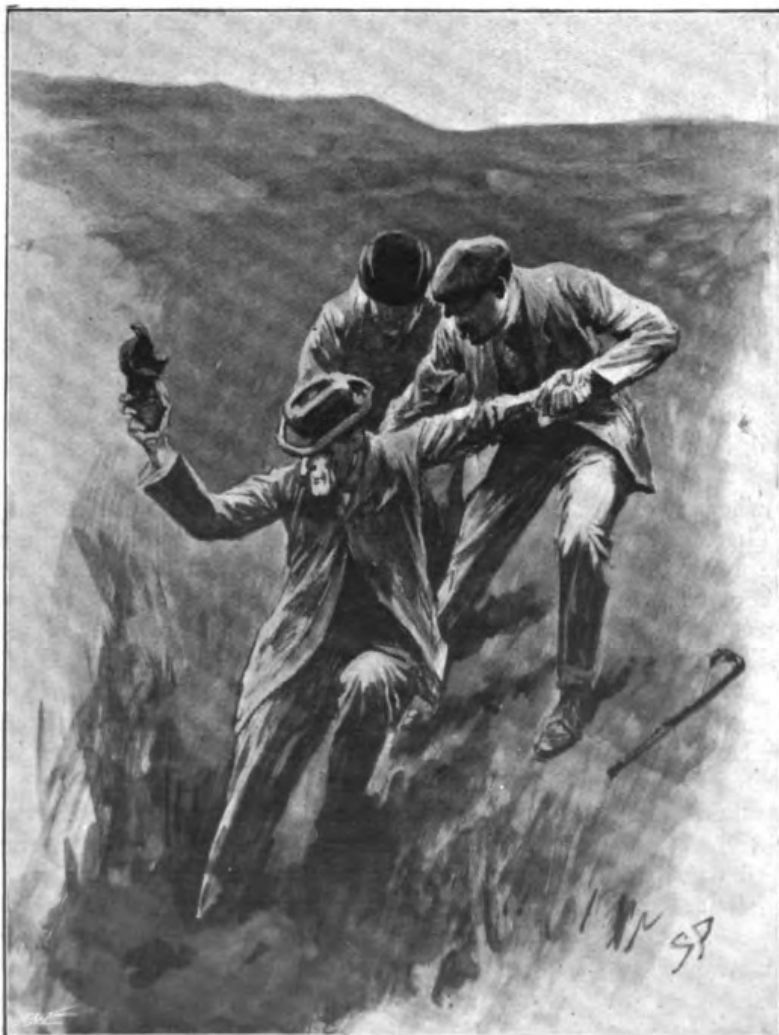
"HE HELD AN OLD BLACK BOOT IN THE AIR."

Many traces we found of him in the bog-girt island where he had hid his savage ally. A huge driving-wheel and a shaft half-filled with rubbish showed the position of an abandoned mine.