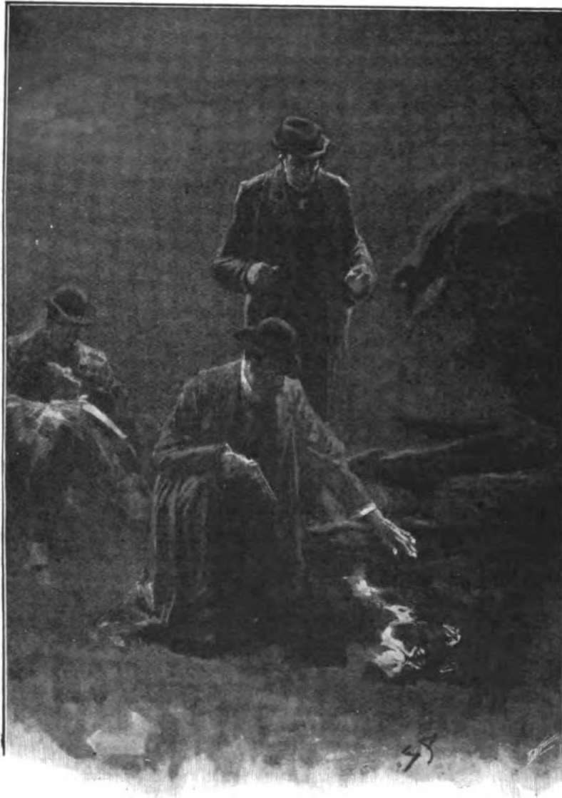
“‘PHOSPHORUS!’ I SAID.”

“The rest of our work must be done, and every moment is of importance. We have our case, and now we only want our man.