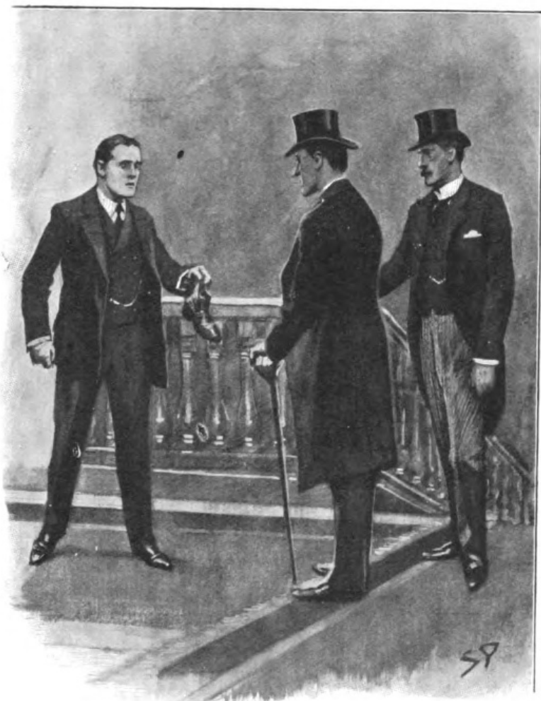
"HE HELD AN OLD AND DUSTY BOOT IN ONE OF HIS HANDS."

only had three pairs in the world—the new brown, the old black, and the patent leathers, which I am wearing. Last night they took one of my brown ones, and to-day they have sneaked one of the black. Well, have you got it? Speak out, man, and don't stand staring!"