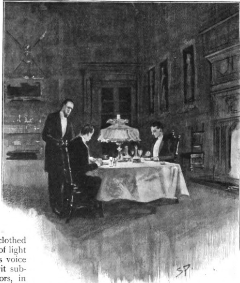
"THE DINING-ROOM WAS A PLACE OF SHADOW AND GLOOM."

A half moon broke through the rifts of racing clouds. In its cold light I saw beyond the trees a broken fringe of rocks and the long, low curve of the melancholy moor. I closed the curtain, feeling that my last impression was in keeping with the rest.