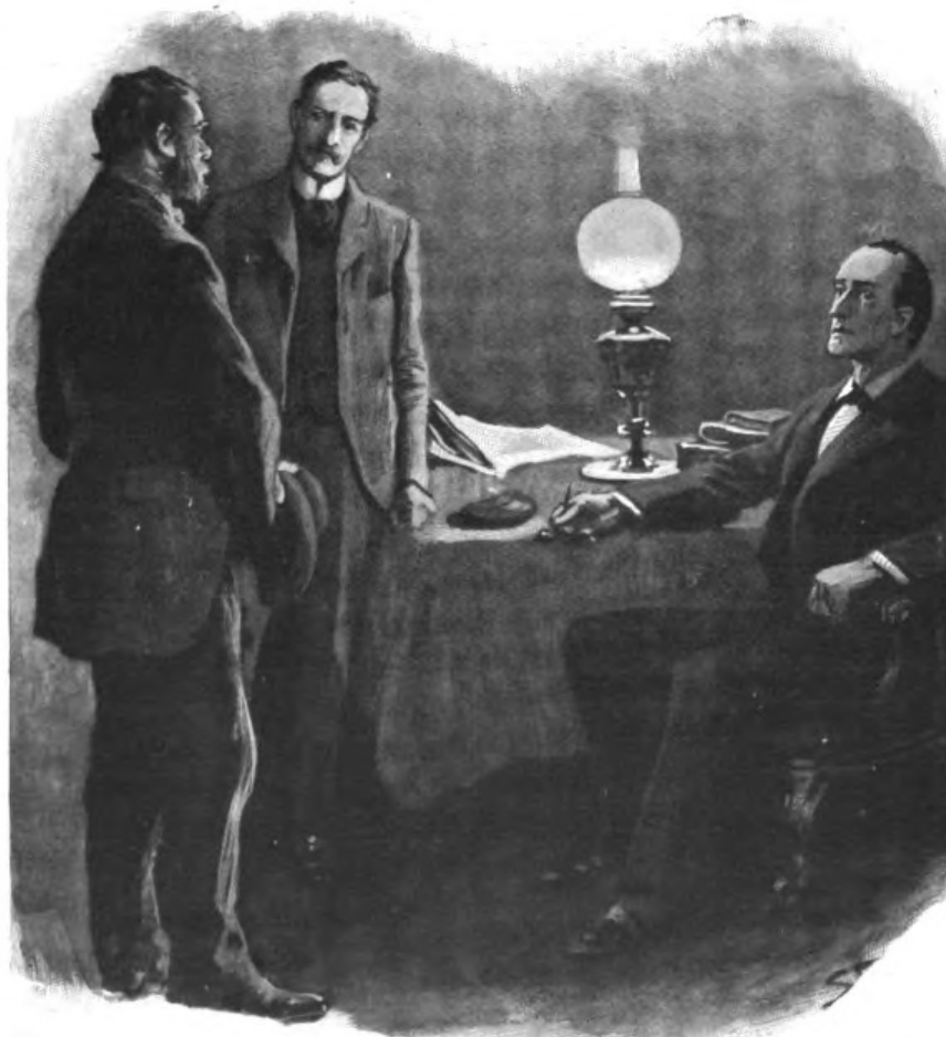
"HIS NAME," SAID THE CABMAN, "WAS MR. SHERLOCK HOLMES."

Never have I seen my friend more completely taken aback than by the cabman's