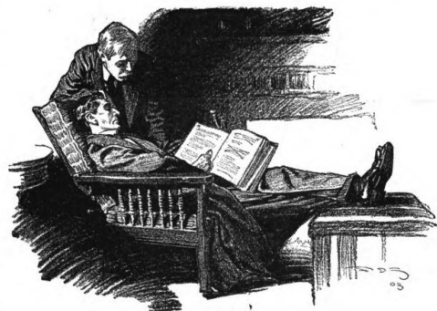
"MY COLLECTION OF M'S IS A FINE ONE"

in which we lay concealed. A door opened and shut. An instant later steps crept down the passage—steps which were meant to be silent, but which reverberated harshly through the empty house. Holmes crouched back against the wall, and I did the same, my hand closing upon the handle of my revolver. Peering through the gloom, I saw the vague outline of a man, a shade blacker than the blackness of the open door. He stood for an instant, and then he crept forward crouching, menacing, into the room. He was within three yards of us, his sinister figure, and I had braced myself to meet his spring, before I realized that he had no idea of our presence. He passed close beside us, stole over to the window, and very softly and noiselessly raised it for half a foot. As he sunk to the level of this opening the light of the street, no longer dimmed by the dusty glass, fell full upon his face. The man seemed to be beside himself with excitement. His two eyes shone like stars, and his features were working convulsively. He was an elderly man, with a thin, projecting nose, a high, bald forehead, and a huge grizzled mustache. An opera hat was pushed to the back of his head, and an evening-dress shirtfront gleamed out through his open overcoat. His face was gaunt and swarthy, scored with deep, savage lines. In his hand he carried what appeared to be a stick, but as he laid it down upon the floor it gave a metallic clang.