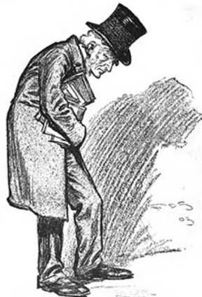
WITH A SNARL HE TURNED UPON HIS HEEL